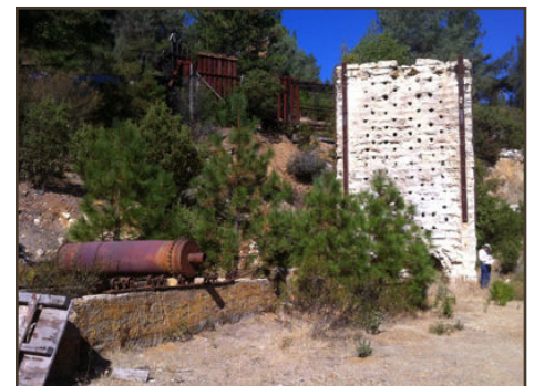
Decaying ore processing structures