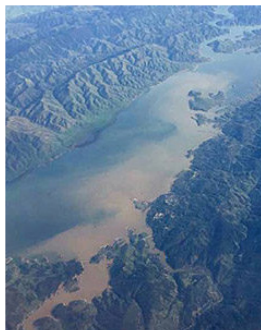
Sediment plume at Lake Berryessa