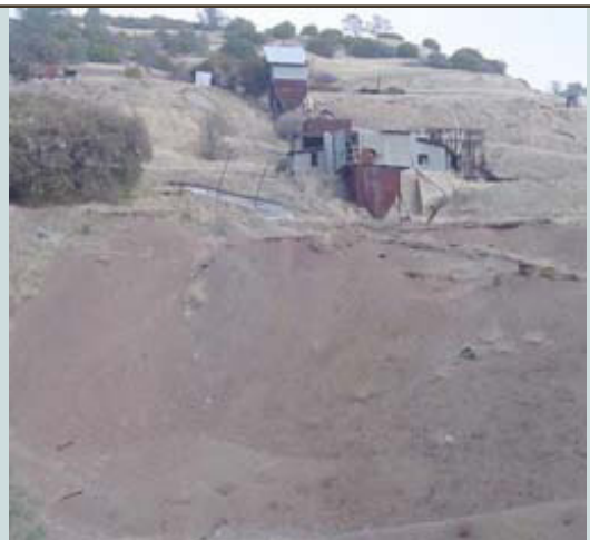
Photo: Abbott-Turkey Run mine site by Hwy. 20 prior to cleanup